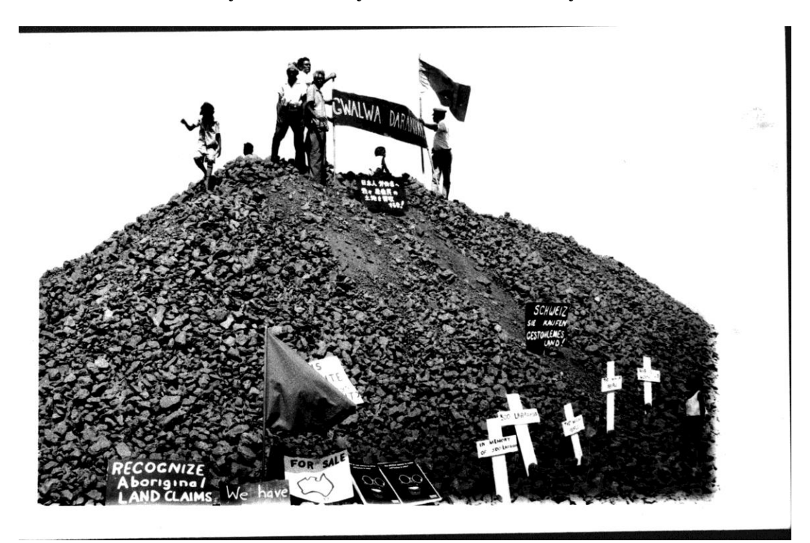
Plate 1: (Above) On top of the iron ore stockpile, Darwin wharf, 14 July 1972.